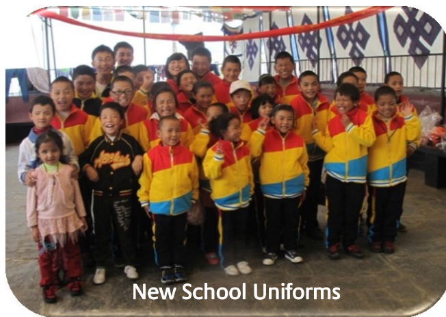
New School Uniforms